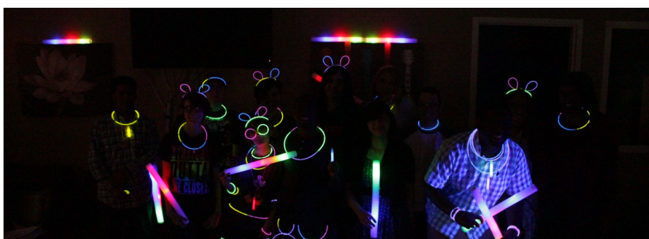
FAHASS Staff Photo at our Glow Party