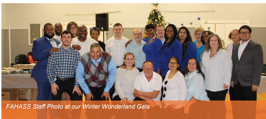
FAHASS Staff Photo at our Winter Wonderland Gala

As a consumer and a member of FAHASS CAB (Consumer Advisory Board), I am looking to be a voice of empowerment and advocacy for HIV/AIDS. My future plans include being able to provide/create peer to peer social programs towards prevention. In doing so, I am looking to work with Agencies, local organizations, and individuals to assist in advocacy for their healthcare needs.